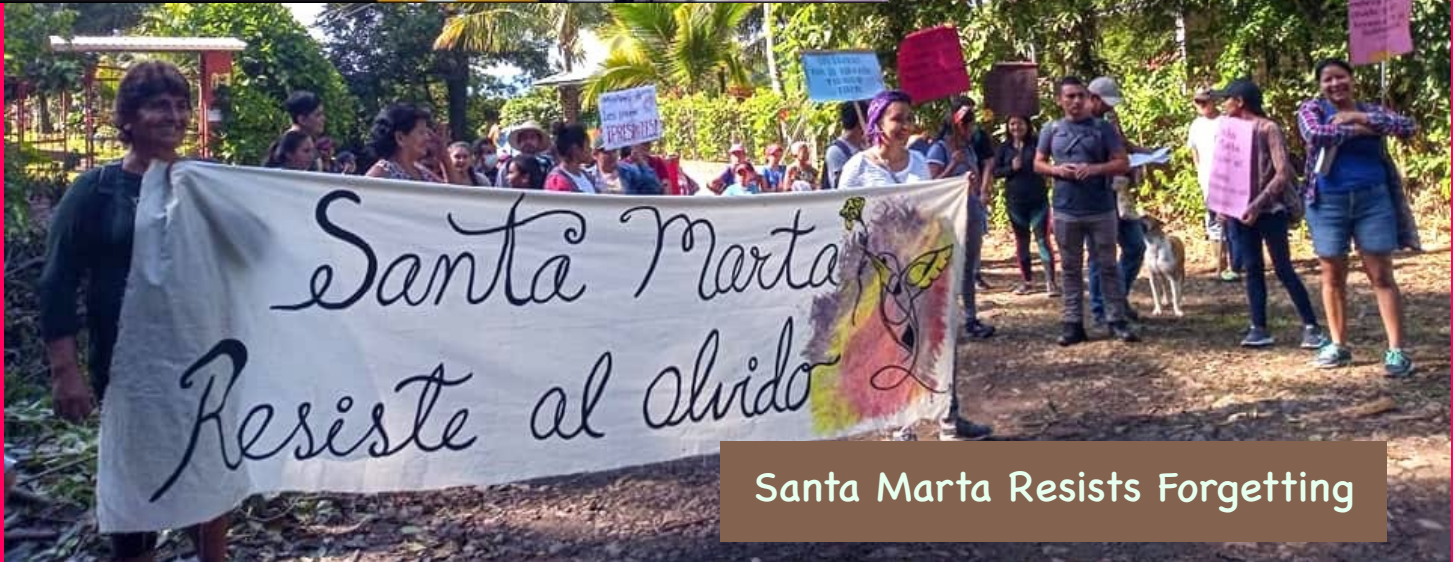
Santa Marta Resists Forgetting